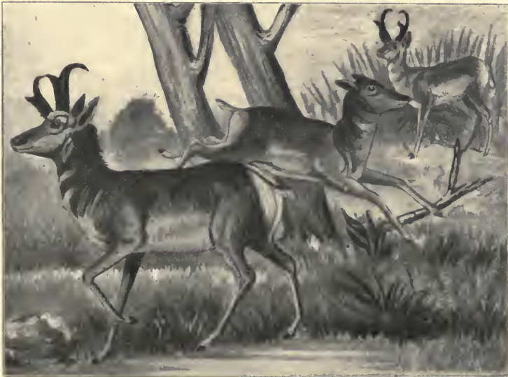
FIG. X. ANTILOCAPRA A. MEXICANA. MEXICAN PRONG-HORN.